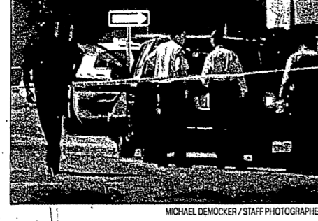
A 43-year-old man was shot and killed in a shooting in Gently, La. The shooting occurred in the parish's main courtroom.

Civilian, brother narrowly escape By News-Martin and Staff A 43-year-old man was shot and killed in a shooting in Gently, La. The shooting occurred in the parish's main courtroom. The shooting occurred in the parish's main courtroom. The shooting occurred in the parish's main courtroom.